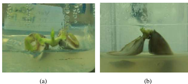
Figure 1. In vitro germination C. edulis seed on various germination media (a) half strength of B5 media; and (b) full strength MS media.

Low C. edulis germination percentage (17%) was obtained from ex vitro experiment [14]. Several species of dry land plants have also been reported to exhibit similar low germination rates. For example, Tamarindus indica , Acacia auriculiformis and Chamaecytisus palmensis have been reported to have a physical or chemical inhibitor for germination so that the seed will only germinate when conditions are favorable [24].