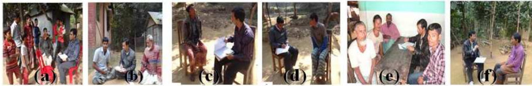
Figure 1. Data collection through interview schedule method at the study areas (a, b: Lalmai Uttargacha, c, d: Hatigara Daskhingacha, e, f: Jummura) of Lalmai hillock region of Comilla

Output value was estimated on the basis of the values of output which farmers disclosed at the time of interview. Benefit cost ratio (BCR) was calculated by the ratio of gross return and input variable costs. Unit production cost was calculated by the ratio of input variable costs and total yield and it was expressed by Tk kg -1 as reported. Data were compiled and subjected to mean, standard deviation (SD) and analysis of co-efficient of variance (CV) using Microsoft Excel after completing the field work and receiving all information in hands. The co-efficient of variation and standard deviation were done to justify the meaningful results.