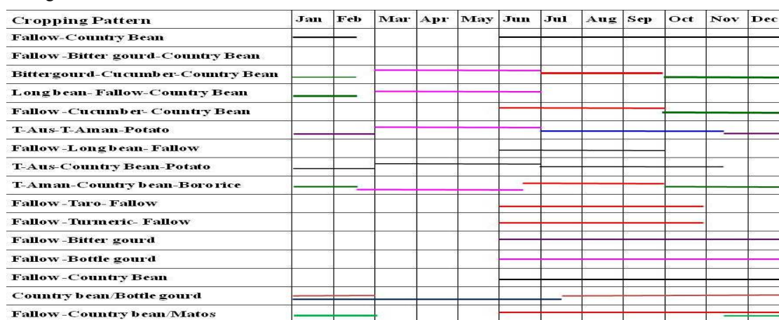
Figure 3. Existing cropping pattern at the study areas

next months. The most cropping pattern was reflected in the utilization pattern of fallow - country bean which had been used only as production purposes. Matos, country bean are grown mainly on hill slopes and hill tops. Other vegetables are grown mostly in valleys. Bitter gourd, snake gourd, bottle gourd and long bean are grown on bamboo framework. The vegetables cultivation starts around mid April and in August. About 40% farmers were cultivated bitter gourd and long bean at the study areas of Lalmai hillock region. It could be said that farmer's response variety was not found high yielding variety (7). During the rabi season the crops are grown in residual soil moisture or by irrigation. During the kharif season the moisture supply from rainfall. Cropping systems, changes in production technology and the economic conditions to the hillock area has found lower to the outside of the hillock. The farmers of the study area have no clear perceptions about natural conditions including land type, cropping patterns and water management. They use traditional knowledge to decide when and which crop will be grown during the year, so that they cannot proper use their resources technology to optimize crop management and get best results.