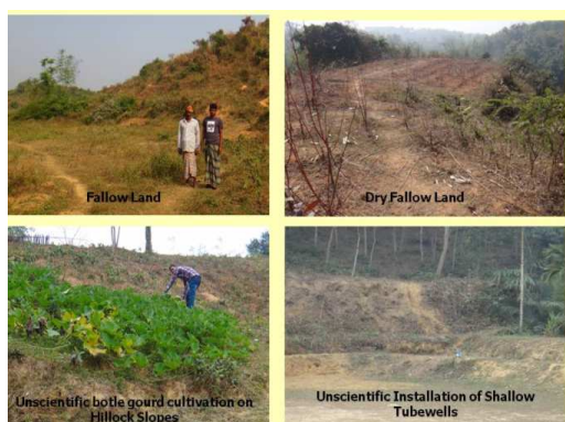
Figure 4. Unscientific crop cultivatin at hillockarea of Lalmai region

Some general problems were observed as follows: